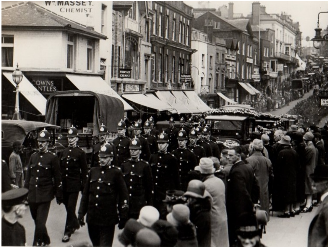
The funeral procession of Chief Constable Nichols, Guildford Borough 1929 North Street, Guildford The photograph may include PC Kendall but in any case shows the uniform and the crowds that indicate the respect shown