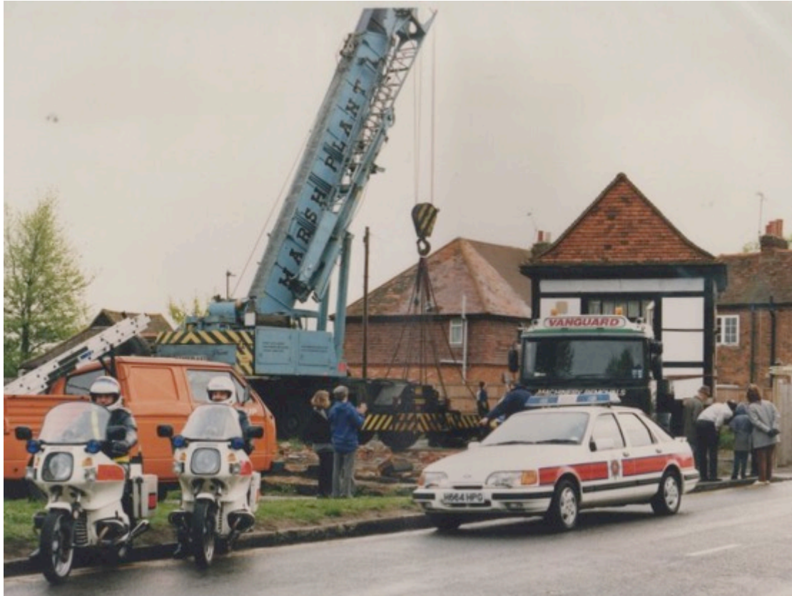
Abnormal load Dave Ovenden left Moving old village bank Ripley May 1992