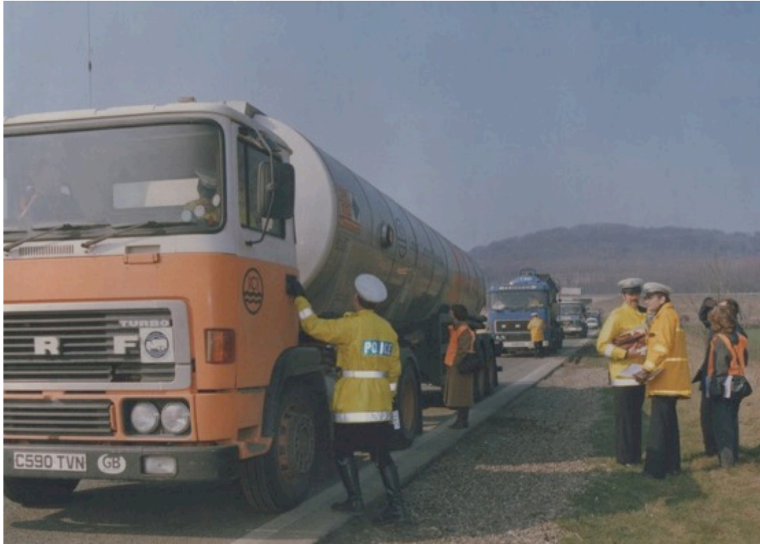
Tanker check Godstone 1985 Dave Ovenden