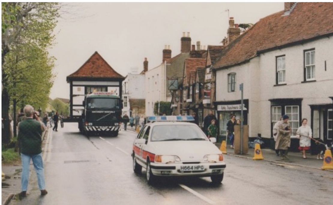
Abnormal load moving old village bank Ripley May 1992