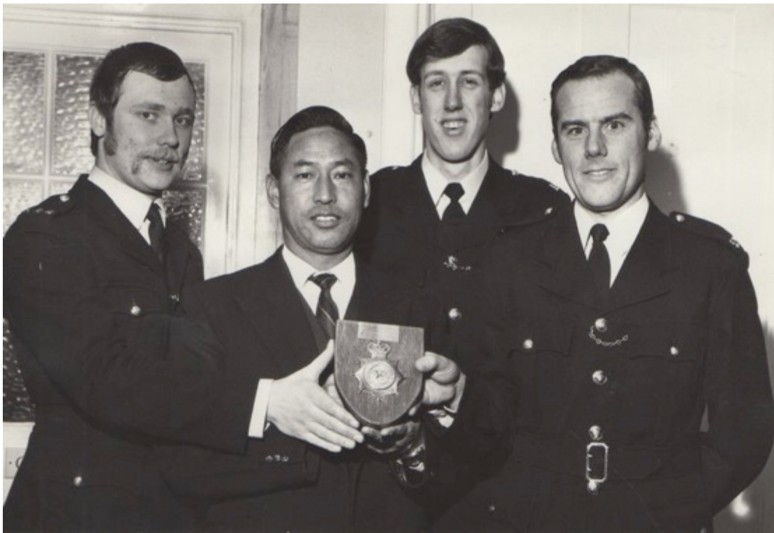
Mayor's presentation following firemen's strike 1978 Dave Ovenden