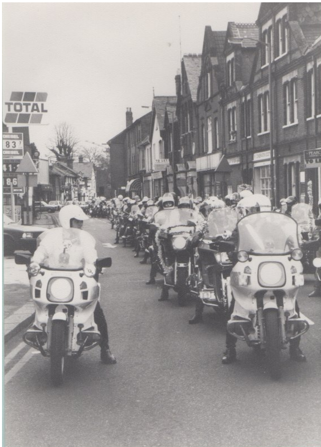
Toy Run Chertsey 1985 Goldwing GB