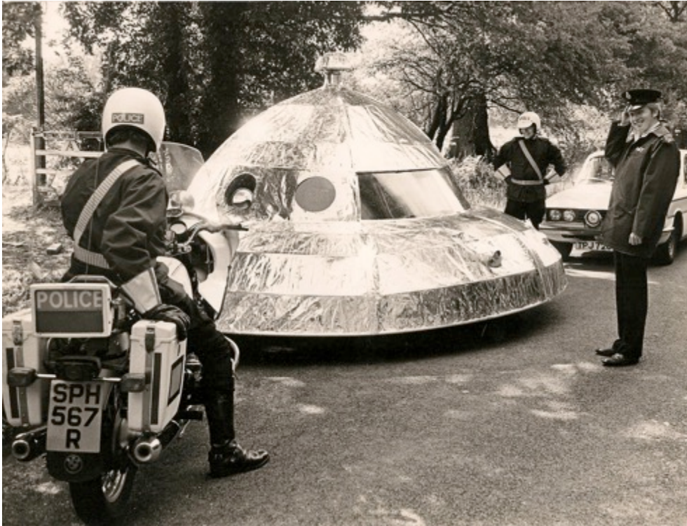
PC Colin Campbell on the right wearing a cap