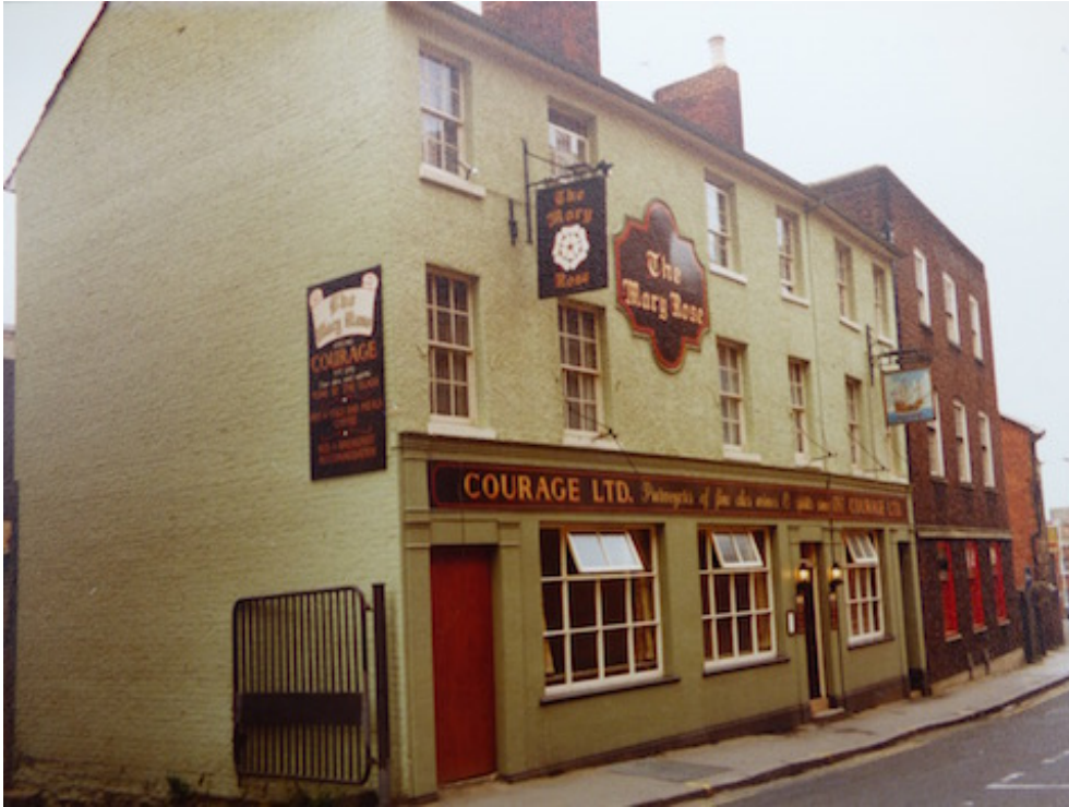
The Carpenters Arms; the section house can be seen joined to the right of the building. More noise when getting to bed for earlies!

There was just enough room, between the bed and the wardrobe for the door to be opened. That was it. That is what you had. Outside on the landing there were a couple of toilets and a couple of showers. There was an ironing board and iron but washing was done in a large bucket on the gas stove in the kitchen. No washing machine or drier. The floor was crammed full of PCs all working different shifts rotas, early turn, late, and nights with others on day off. Movement was constant with people coming and going, laughing and joking; radios playing.